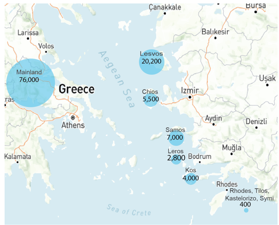
Refugee and asylum-seekers population in the islands as of 22 March 2020 (population figure on the mainland as of 29 February 2020).

UNHCR, the UN Refugee Agency, is scaling up its support in Greece to help the authorities mitigate the risk of COVID-19 spreading rapidly, especially to overcrowded reception centres where thousands of asylum-seekers – including elderly and vulnerable – are living in squalid conditions. To date, the country hosts over 115,000 refugees and migrants, of whom 40,000 are living on the islands, and are at high risk in case of an outbreak.