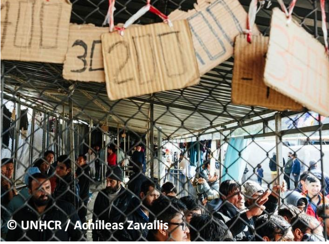
Refugees on the island of Lesvos

Strengthening communications and making quality information available for refugee and displaced communities on hygiene measures is essential, by using available as well as ad hoc national and community mechanisms and adapting communication materials to suit local linguistic and cultural needs. To this end, interpreters with clear consideration of specific languages requirements are key to enable UNHCR discharge its mandate and support all ongoing activities on the islands, in particular to boost the communication with communities and messaging to persons of concern in relation to preventive measures related to COVID-19 (hygiene awareness sessions, fighting rumours and dissemination of official information).